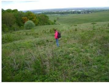
Entrance to Therfield Heath